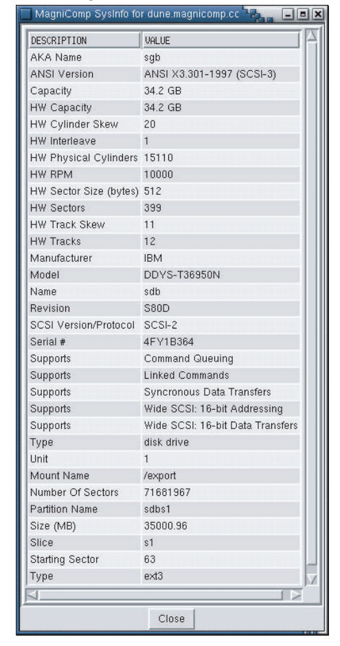
Figure 1 - Detailed Disk Information

SysInfo supports both a sophisticated Command Line Interface (CLI) for consumption by both humans and programs, as well as a Graphical User Interface (GUI) (Figure 2) to organize and browse the volumes of available data.