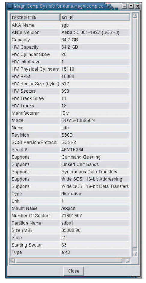
Figure 1 - Detailed Disk Information

SysInfo supports both a sophisticated Command Line Interface (CLI) for consumption by both humans and programs, as well as a Graphical User Interface (GUI) (Figure 2) to organize and browse the volumes of available data.